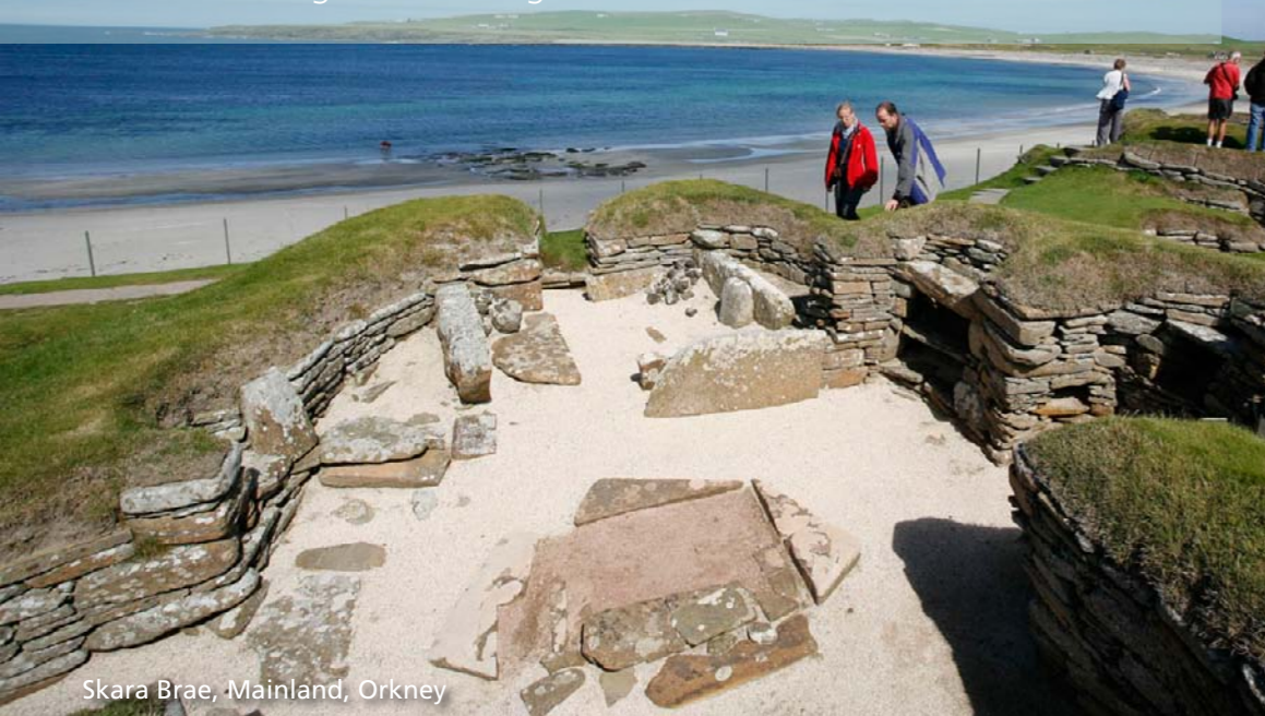
Skara Brae, Mainland, Orkney

Visitors will immediately feel at home in Orkney with plenty of space to relax and places to discover. You can walk through 5,000 years of history in a few steps from standing stones to brochs and Viking settlements. Pass an evening in the company of local, talented fiddle players, listening to stories of days gone-by. Sit on an empty beach watching the gulls gliding by, the seals basking in the sun, and the waves breaking the stunning shoreline.