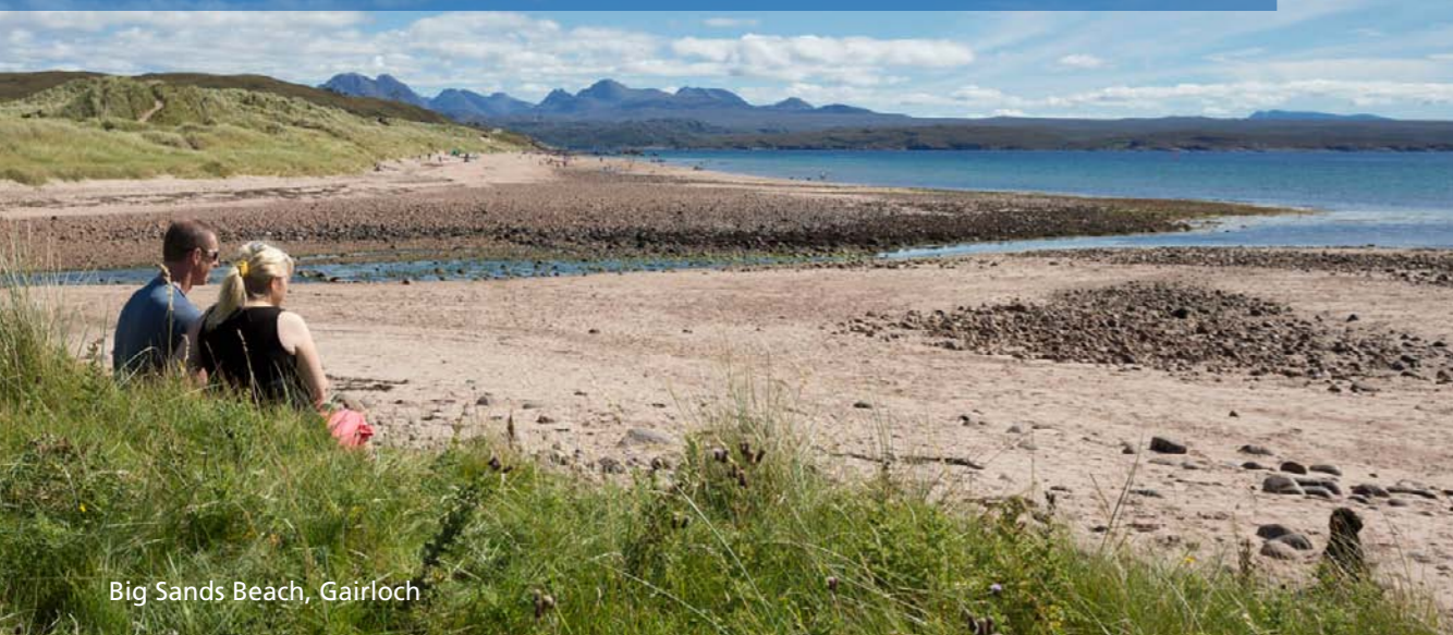
Big Sands Beach, Gairloch

Uncover the truly fascinating history of the North Highlands by visiting historic castles, museums and visitor centres. It's also the Year of Natural Scotland, so now is the perfect time to experience the epic terrain of the mountains, lochs, waterfalls and beaches of this region. Look out for whales and dolphins on a wildlife tour or get active and enjoy mountain biking, walking, kayaking, fishing, golfing and more. Climb a mountain, visit a castle or dine out in award-winning eateries; there's plenty of things to see and so in this wonderful part of Scotland.