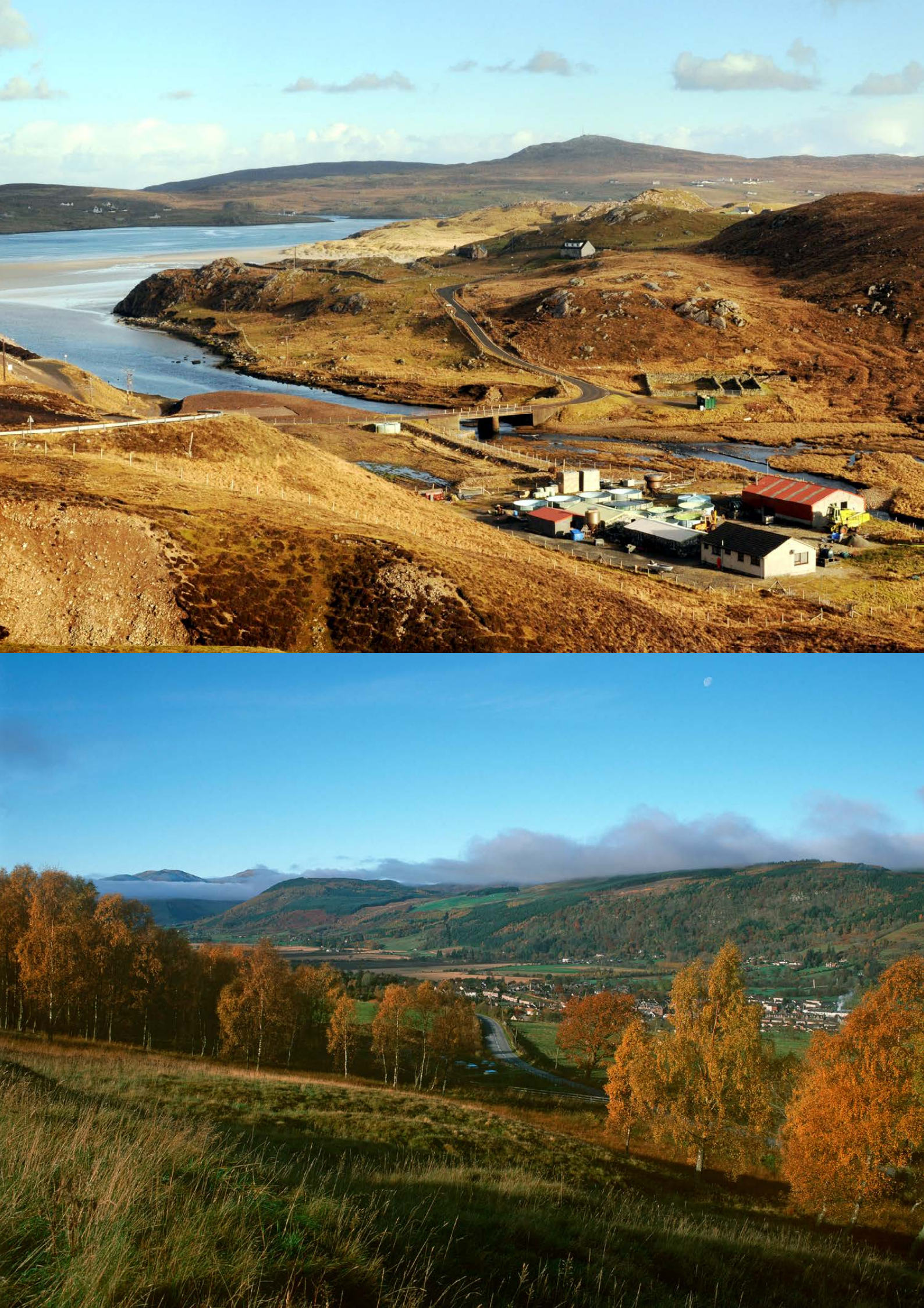
The peaceful countryside near Aberfeldy