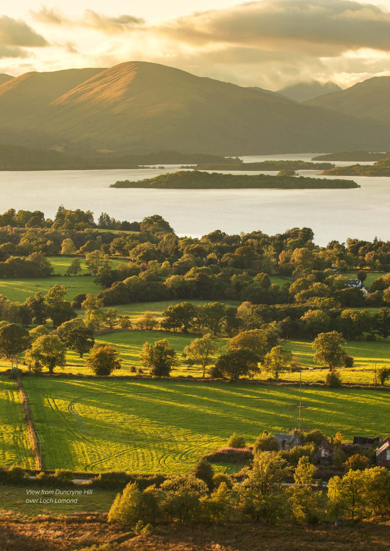
View from Duncryne Hill over Loch Lomond