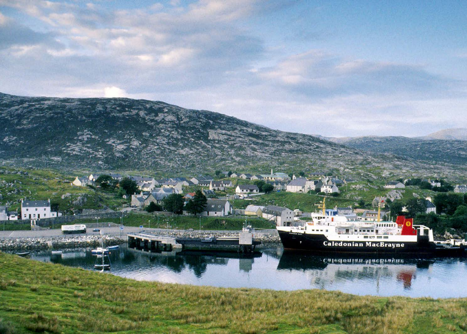
Looking over the water to Craighouse, on Jura