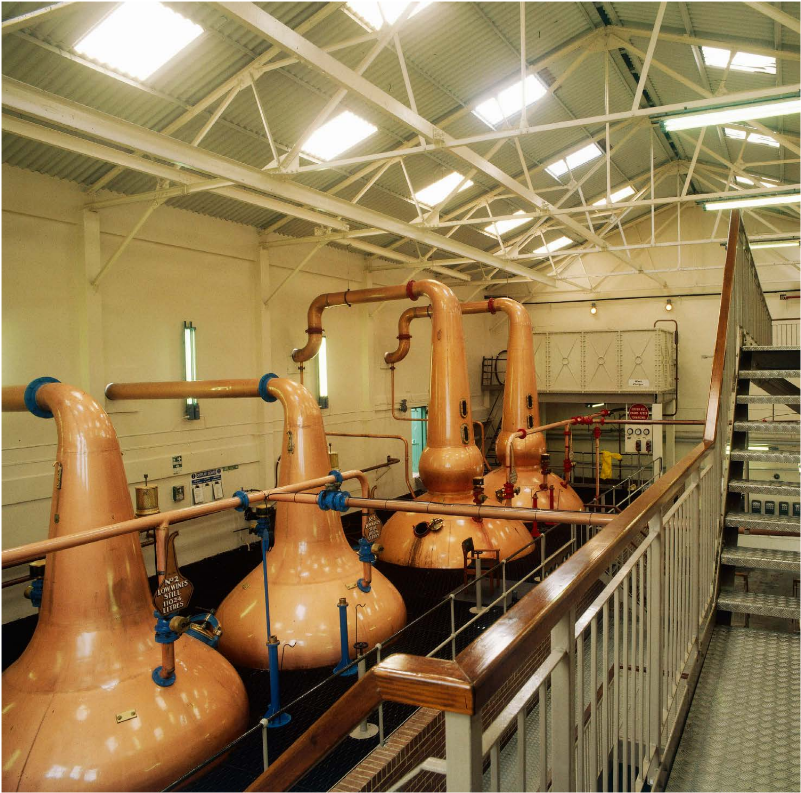
The still room at Talisker Distillery