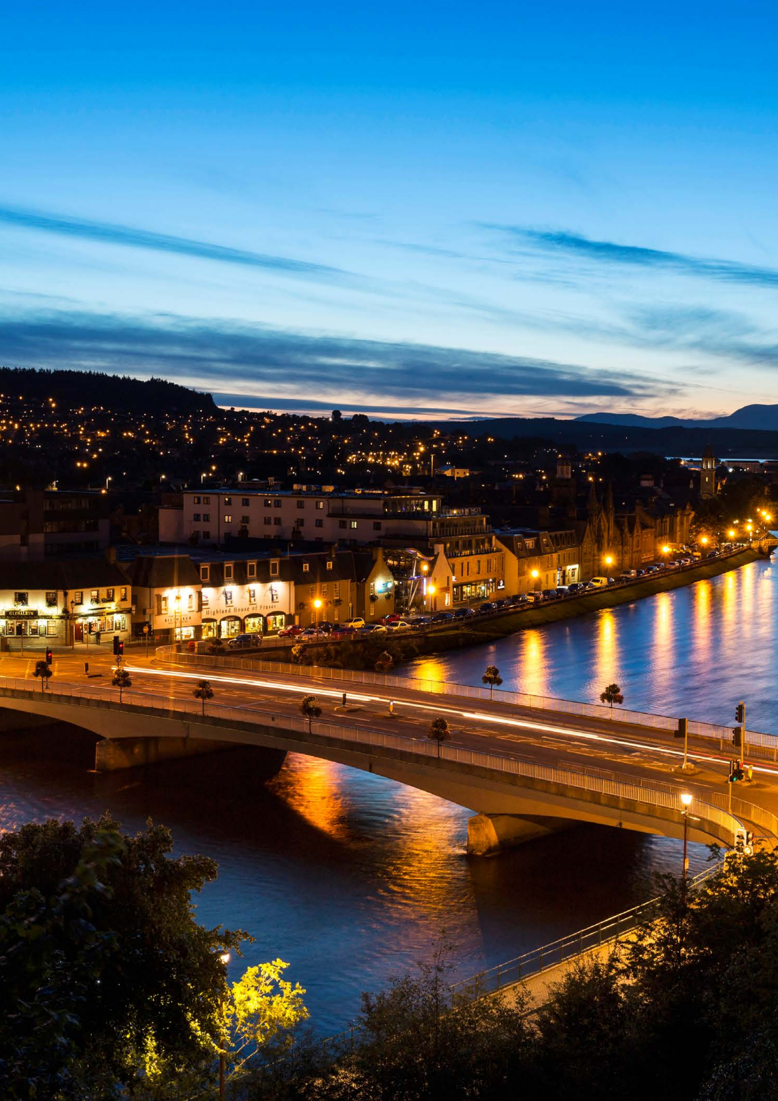
The nearby city of Inverness on a summer’s night