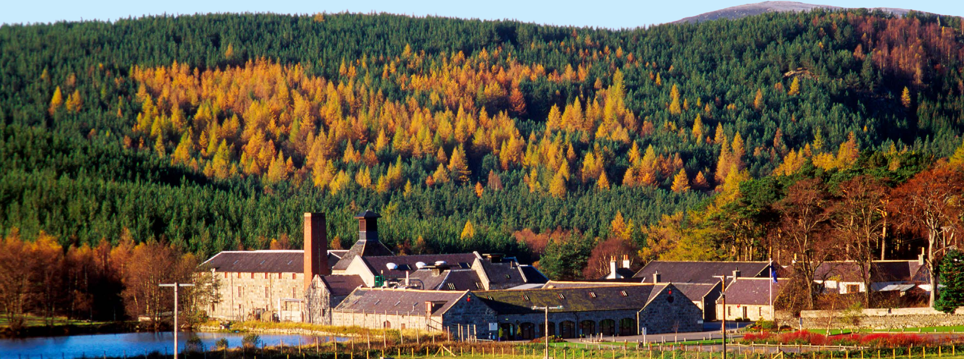
Royal Lochnagar Distillery