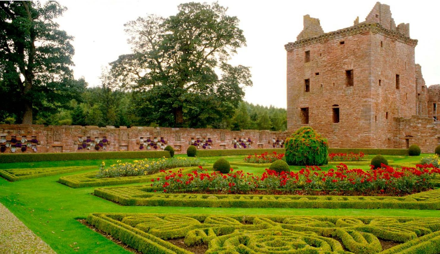
The nearby Edzell Castle and its pretty gardens