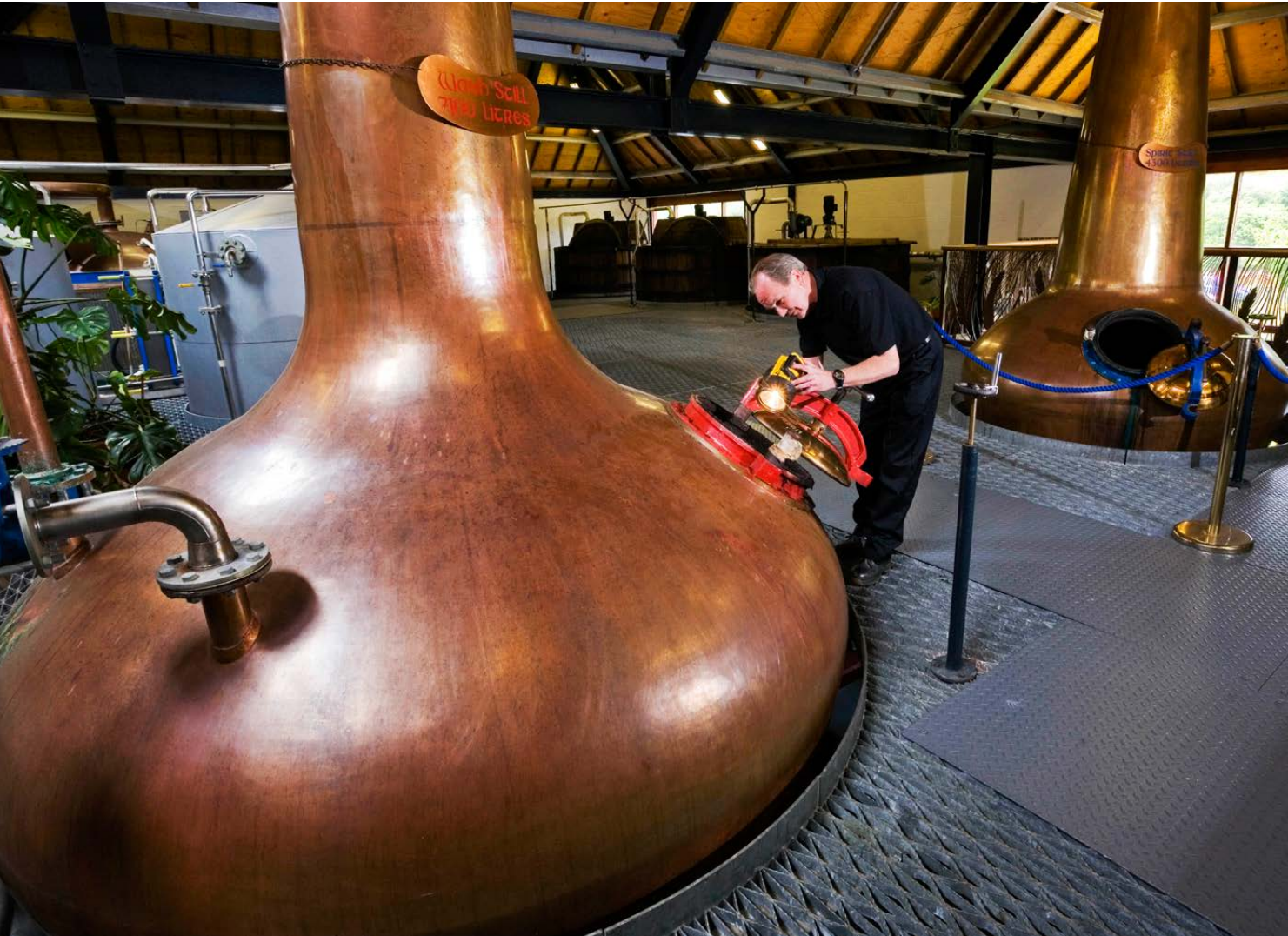
Highland Park Distillery