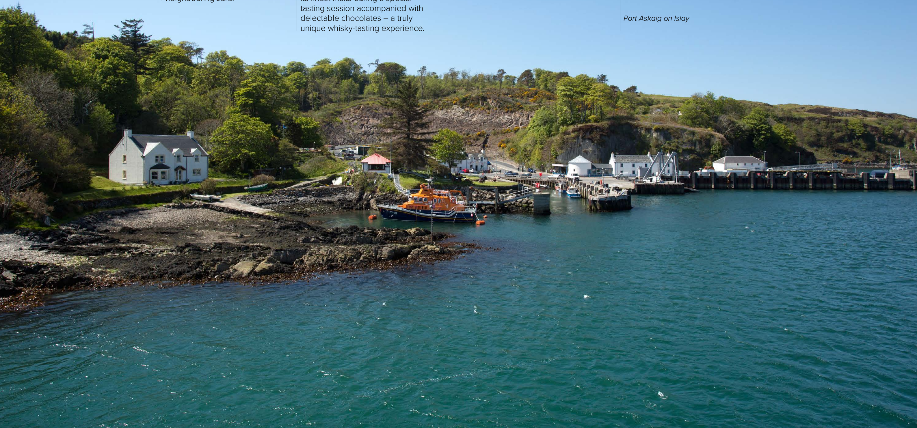
Port Askaig on Islay