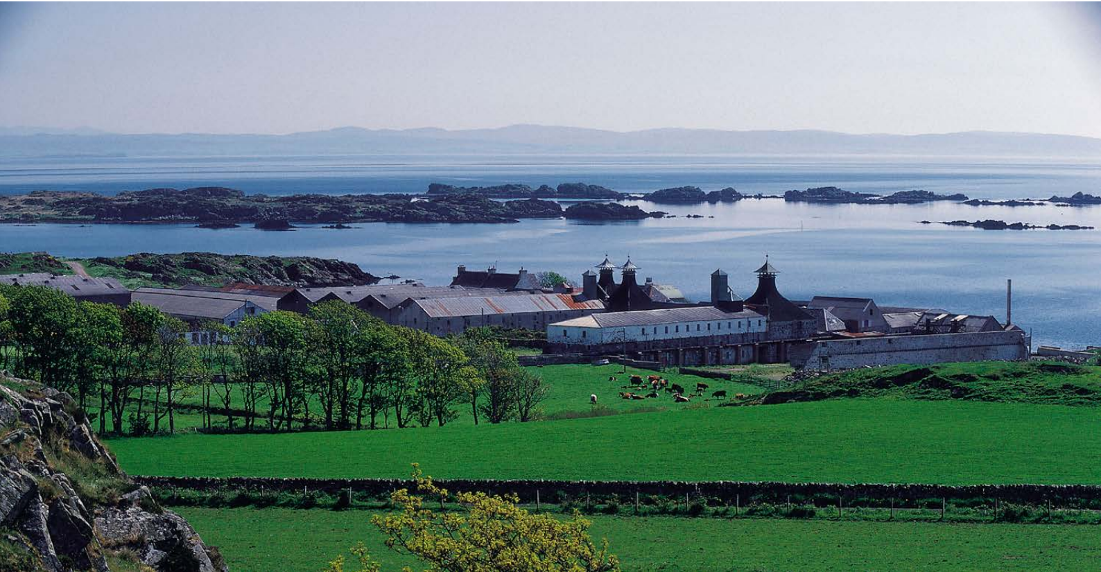
Looking along the coastline to Bunnahabhain Distillery on Islay

Both these bottlings and other Bunnahabhain whiskies are available to purchase from a number of retail outlets and from the website shop.