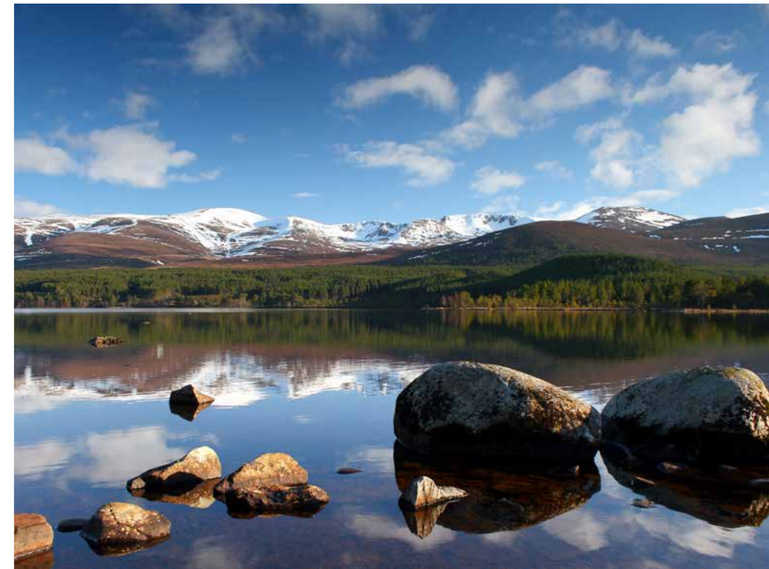
Loch Morlich in the Cairngorm National Park