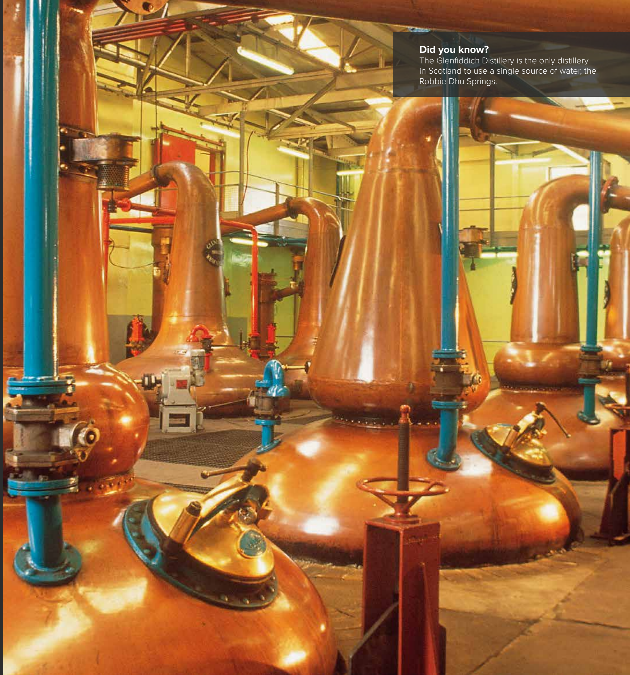
The still room of Glenfiddich Distillery

The Glenfiddich Distillery is the only distillery in Scotland to use a single source of water, the Robbie Dhu Springs.