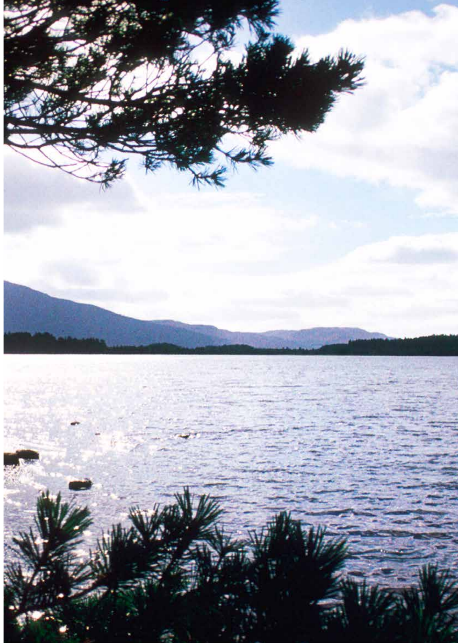
The beautiful Loch Garten