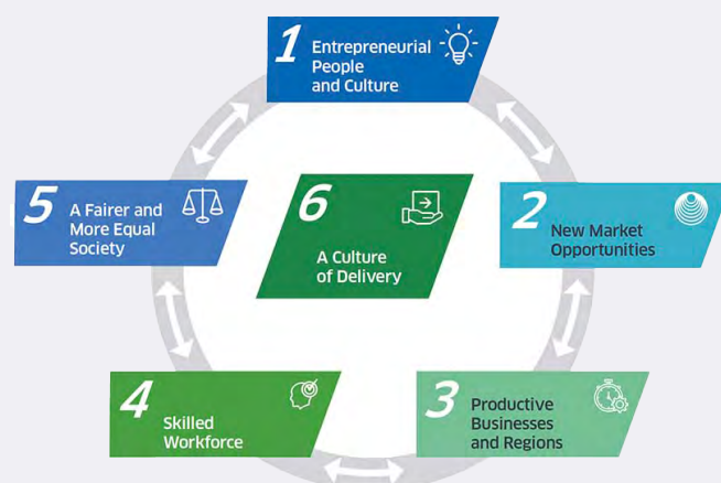
Figure 2: NSET priority areas