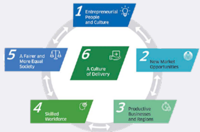
Figure 2: NSET priority areas