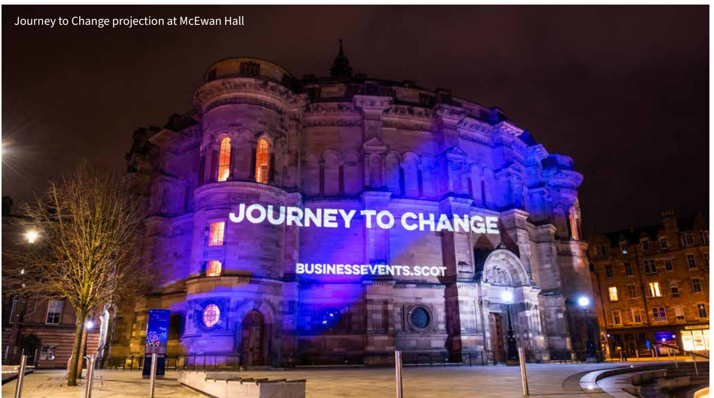
Journey to Change projection at McEwan Hall